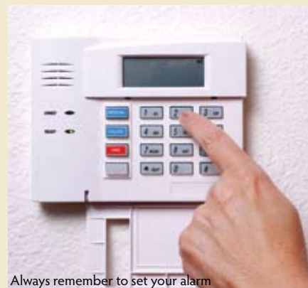
Always remember to set your alarm

See if your local police department has a vacation watch program. My agency, the Harris County Precinct Four Constable's Office, provides this as a free service and can be set up with a visit to our website. Record the contents and layout of your home before you