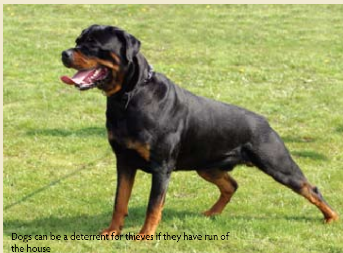
Dogs can be a deterrent for thieves if they have run of the house