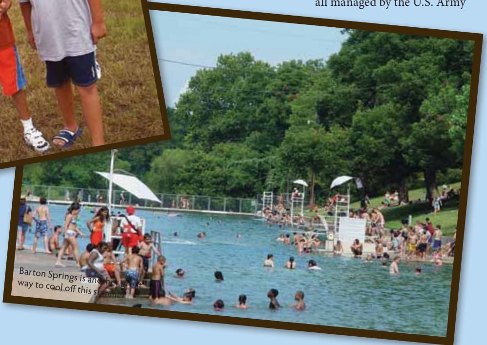
Barton Springs is another great way to cool off this summer