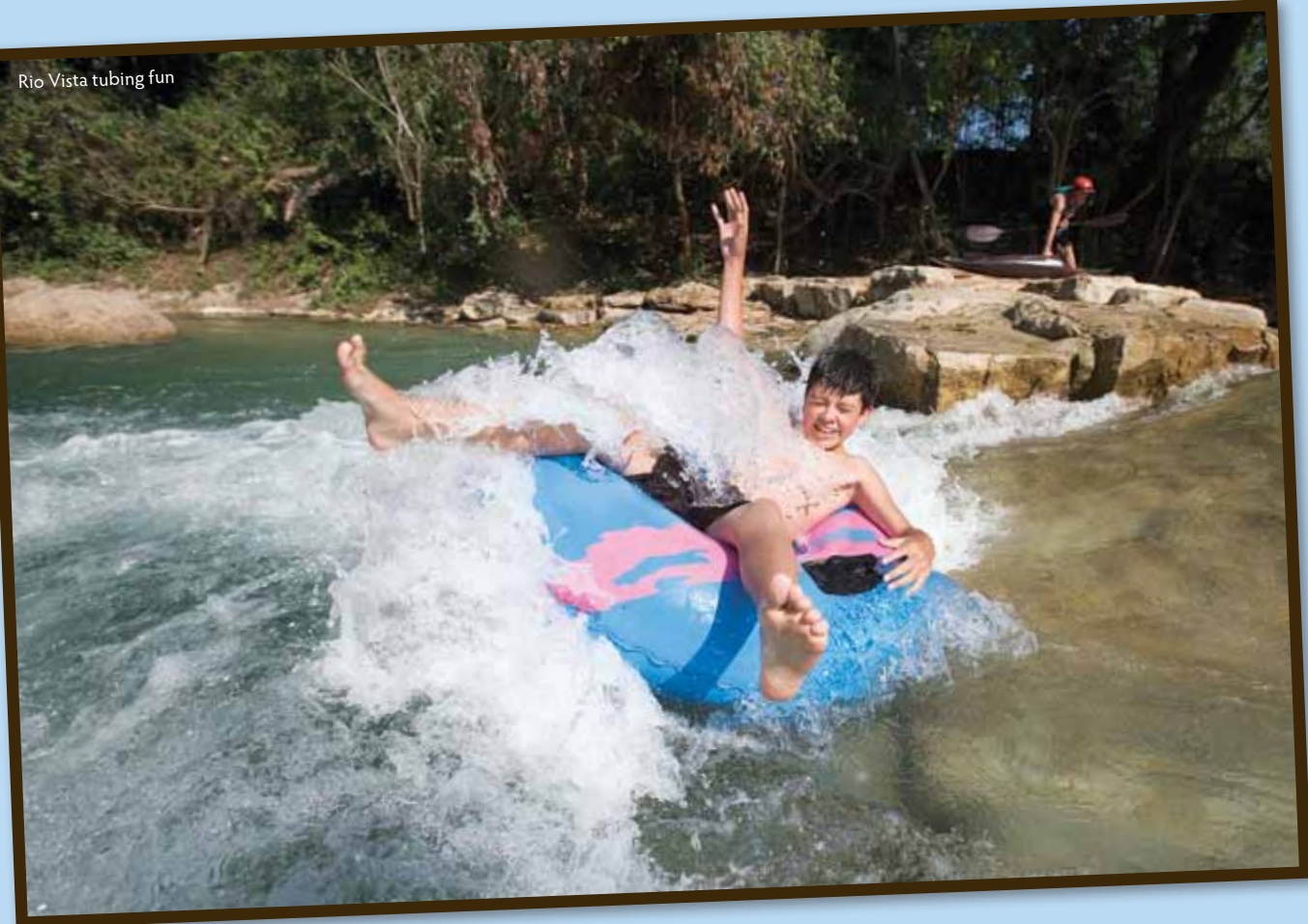
Rio Vista tubing fun

In addition to water skiing, families can swim in the fresh water lake and go camping, fishing, biking, boating, and more. Cabins are