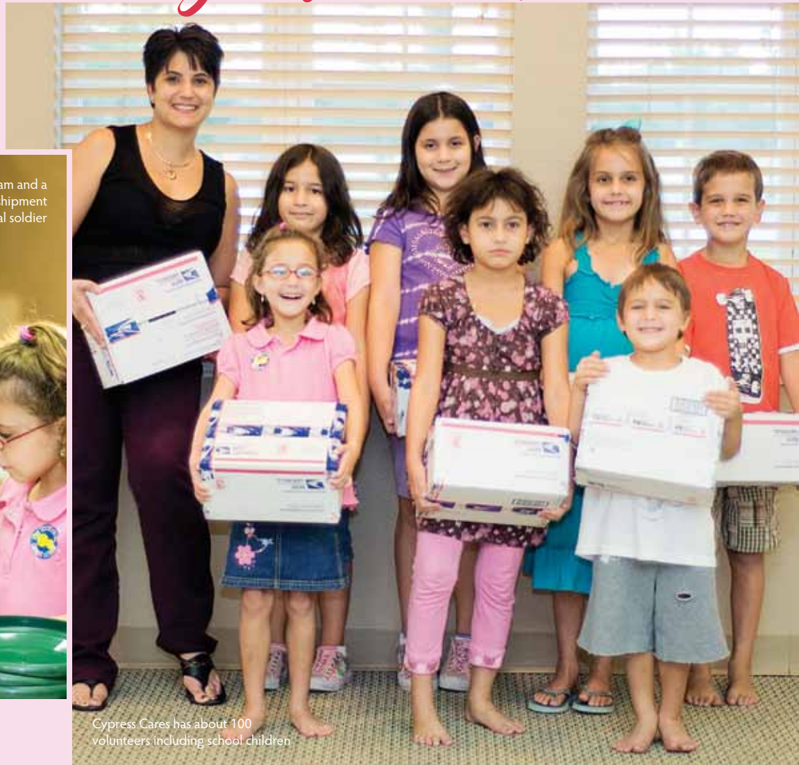
Cypress Cares has about 100 volunteers including school children