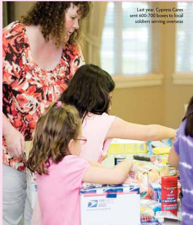
Last year, Cypress Cares sent 600-700 boxes to local soldiers serving overseas