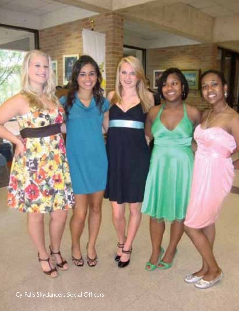
Cy-Falls Skydancers Social Officers