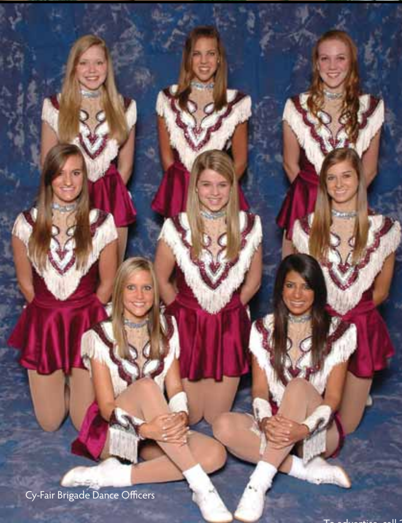
Cy-Fair Brigade Dance Officers