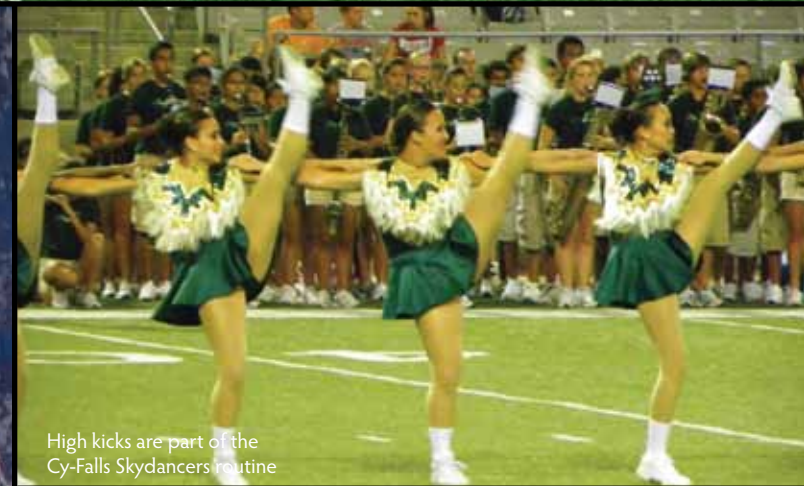
High kicks are part of the Cy-Falls Skydancers routine