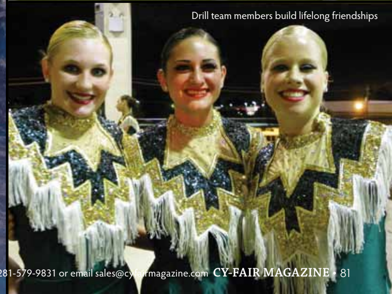
Drill team members build lifelong friendships