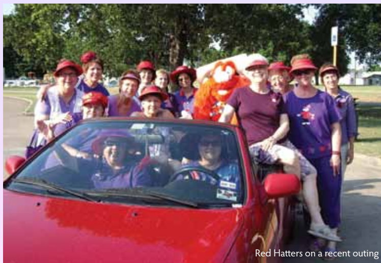
Red Hatters on a recent outing

If you've come across a group of mature women dressed up in bright red hats and purple clothes, you've encountered some of the proud members of the Red Hat Society. Eight of the 24,000 Red Hat chapters worldwide are based in the Cy-Fair area.