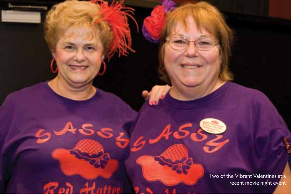
Two of the Vibrant Valentines at a recent movie night event