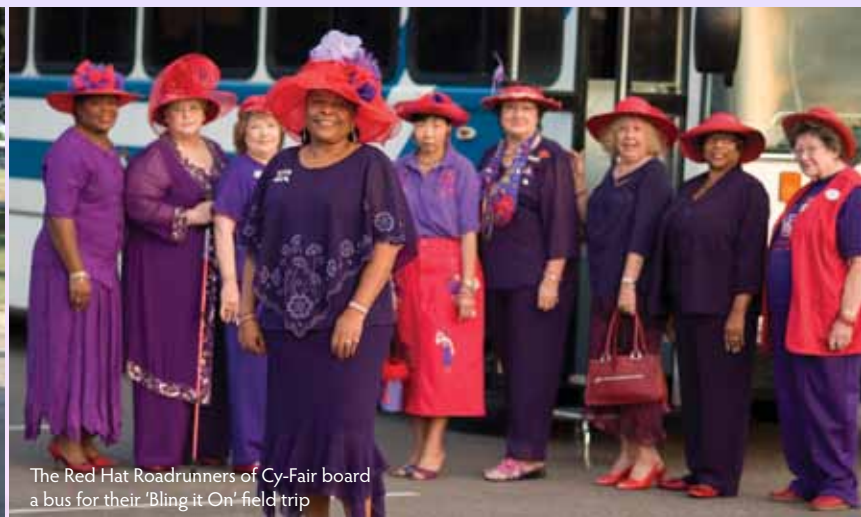
The Red Hat Roadrunners of Cy-Fair board a bus for their 'Bling it On' field trip