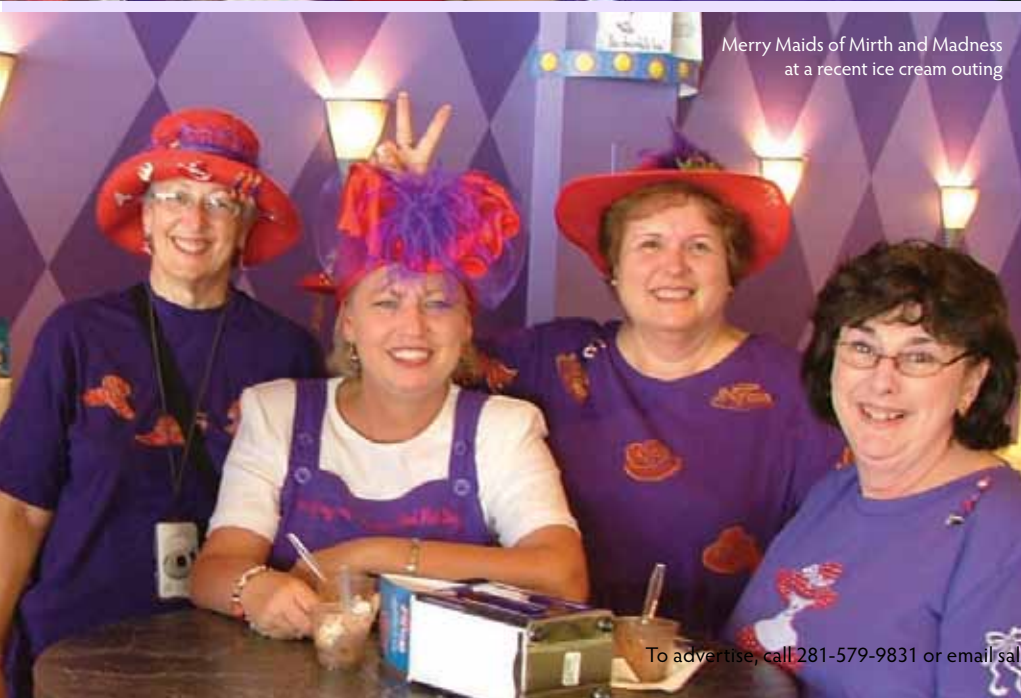
Merry Maids of Mirth and Madness at a recent ice cream outing