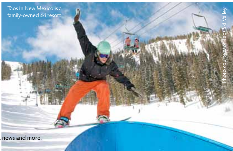
Taos in New Mexico is a family-owned ski resort