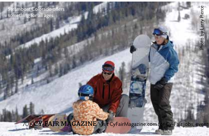
Steamboat Colorado offers something for all ages