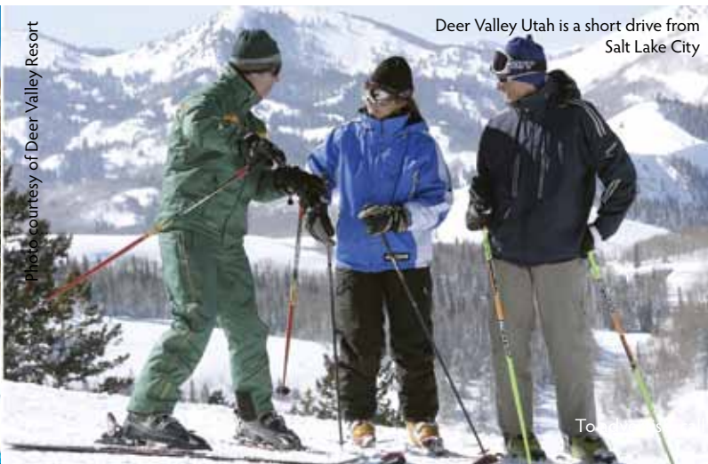
Deer Valley Utah is a short drive from Salt Lake City