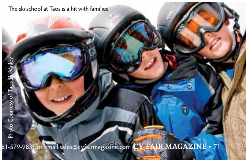
The ski school at Taos is a hit with families