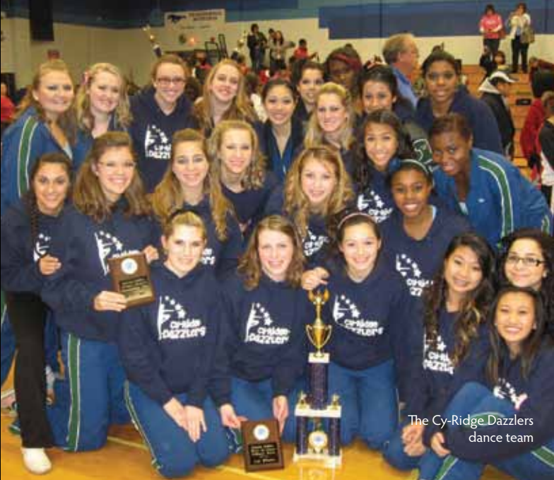
The Cy-Ridge Dazzlers dance team