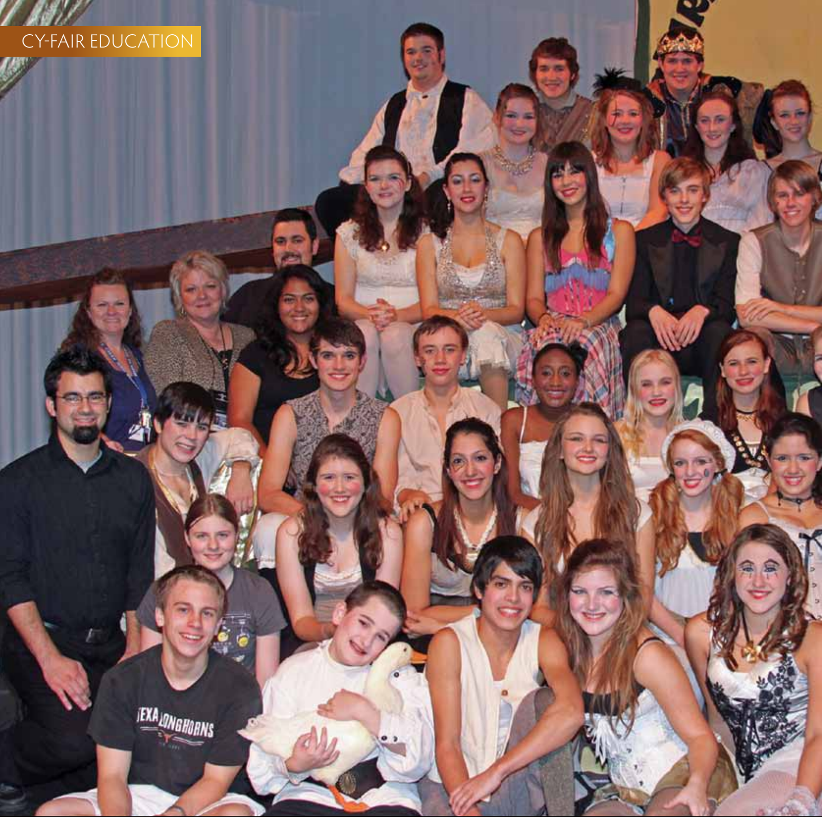
Students learn creative expression through fine arts programs like the Cy-Falls theater group