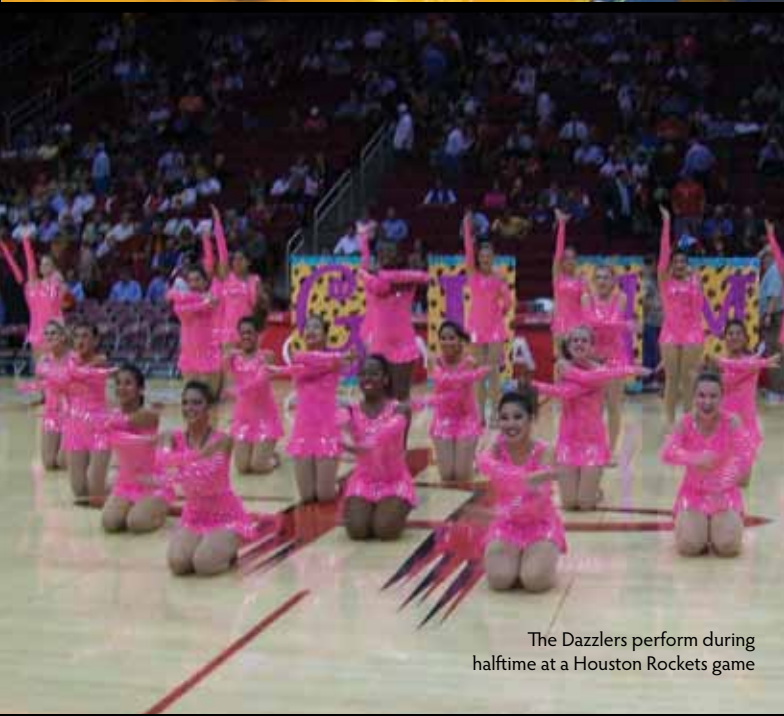
The Dazzlers perform during halftime at a Houston Rockets game