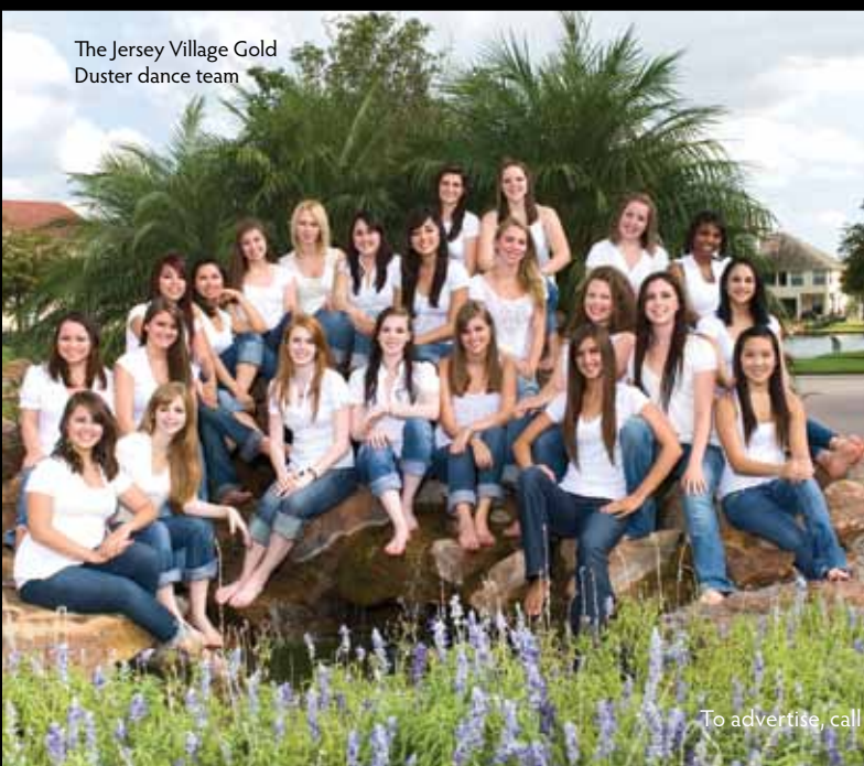
The Jersey Village Gold Duster dance team