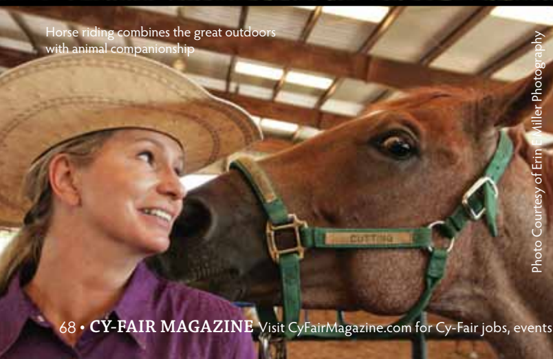
Horse riding combines the great outdoors with animal companionship