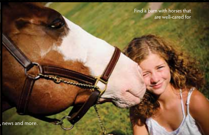
Find a barn with horses that are well-cared for