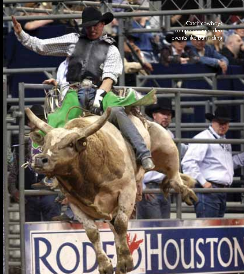
Catch cowboys competing in rodeo events like bull riding

For $10 per person on Wednesdays, you receive admission to Reliant Park and a concert ticket in the upper level of the stadium for feature artists such as Dierks Bentley on March 3, Rascal Flatts in conjunction with Salute to Our Troops Day on March 10, and Gary Allan on March 17, in addition to the championship rodeo. For visitors who don't want to attend the concert or rodeo events, value days offer free admission for seniors 60 and over and children 12 and under, $5 general admission to Reliant Park, free or reduced parking, and shuttle service up until 3 p.m. There will