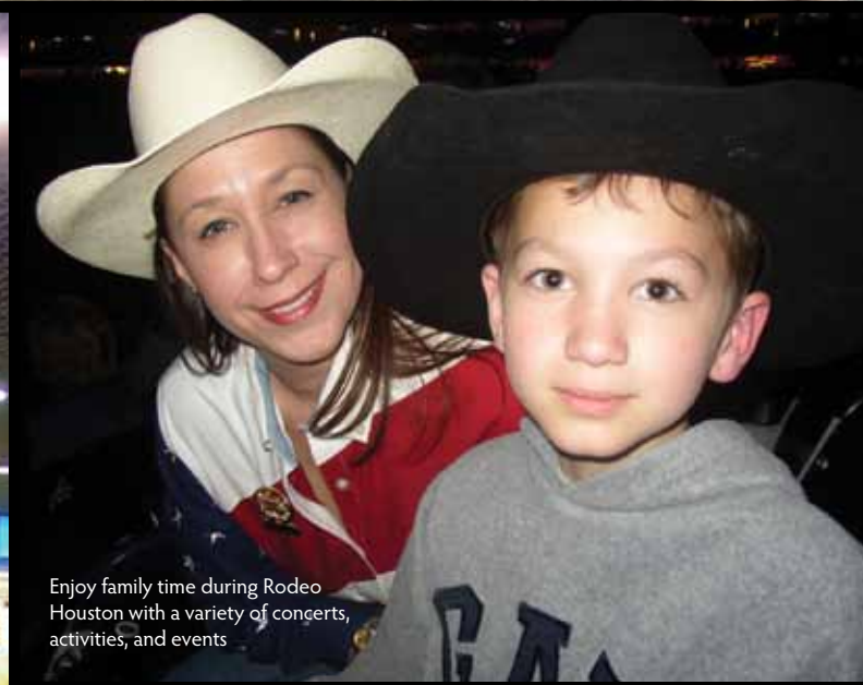
Enjoy family time during Rodeo Houston with a variety of concerts, activities, and events