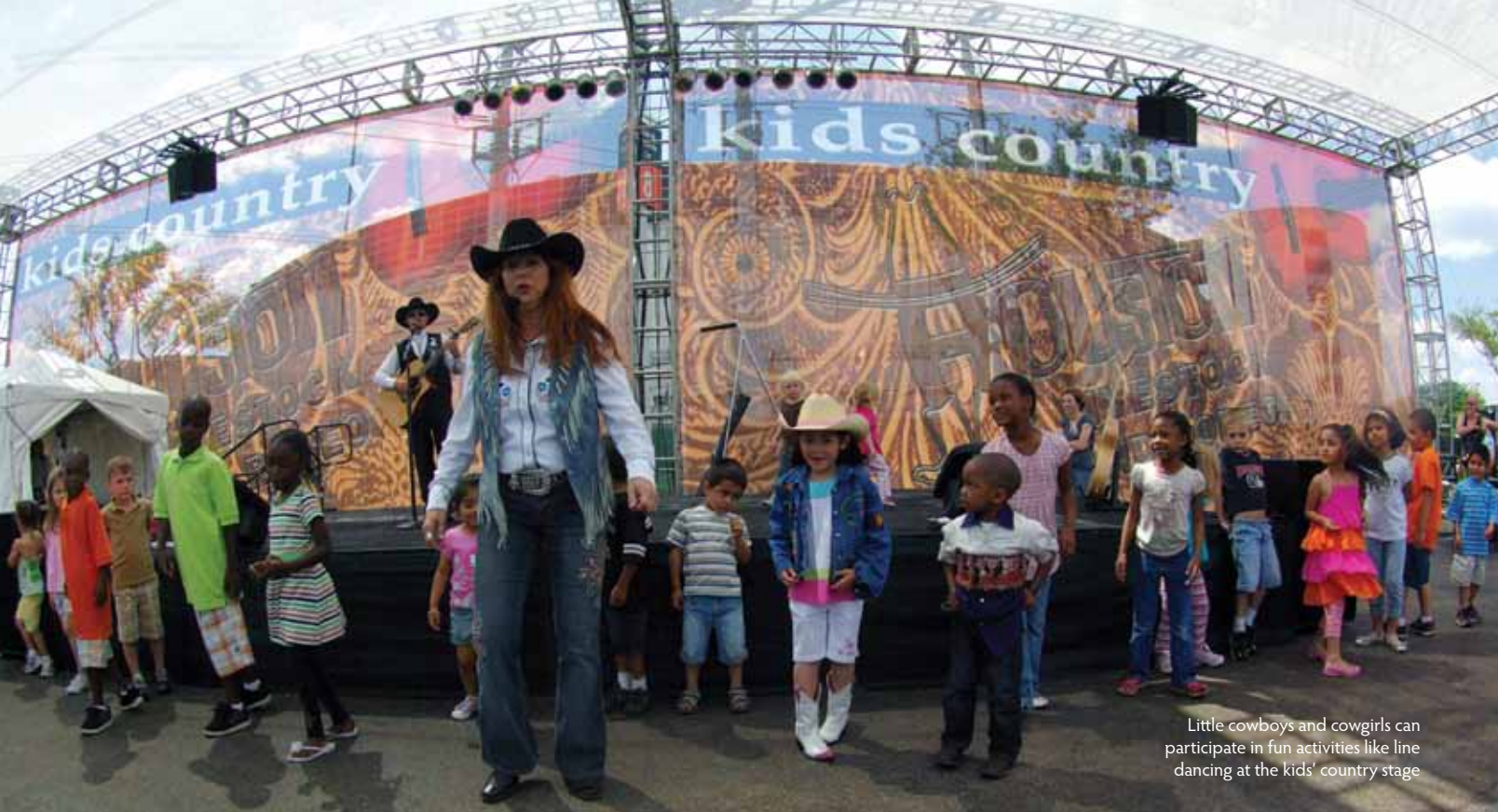
Little cowboys and cowgirls can participate in fun activities like line dancing at the kids' country stage