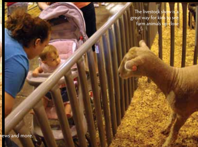
The livestock show is a great way for kids to see farm animals up close