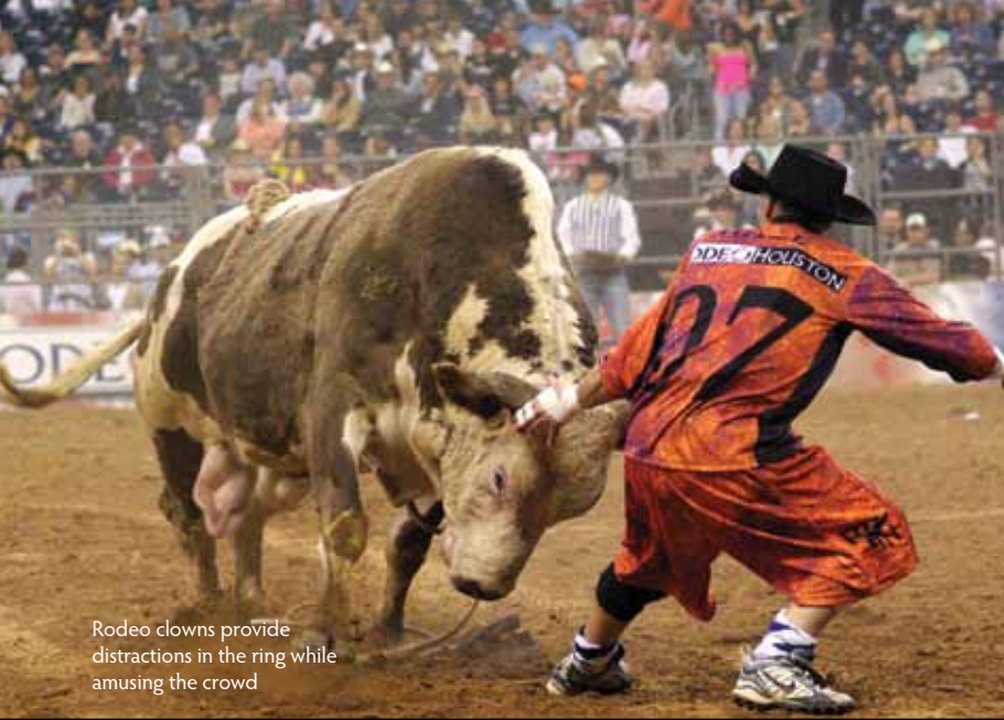
Rodeo clowns provide distractions in the ring while amusing the crowd