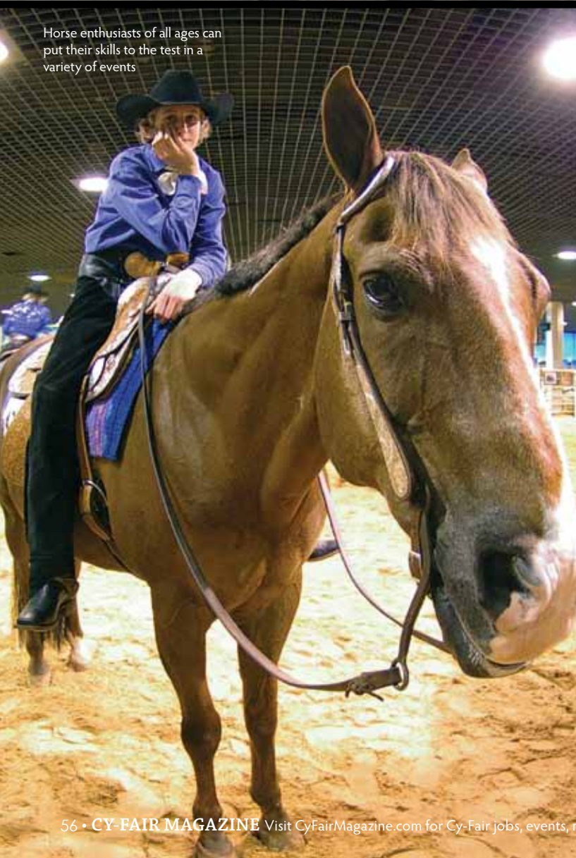
Horse enthusiasts of all ages can put their skills to the test in a variety of events