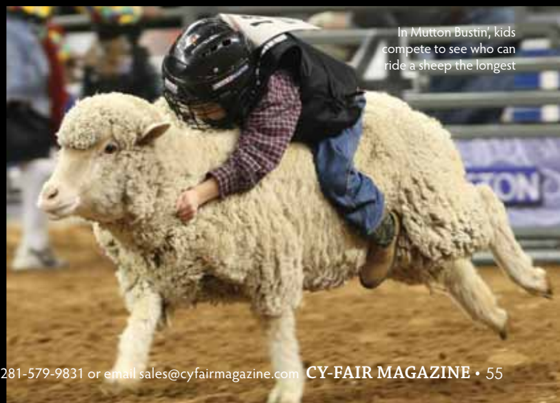
In Mutton Bustin', kids compete to see who can ride a sheep the longest