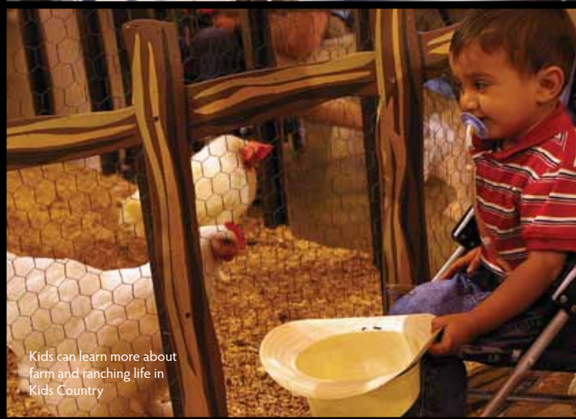
Kids can learn more about farm and ranching life in Kids Country