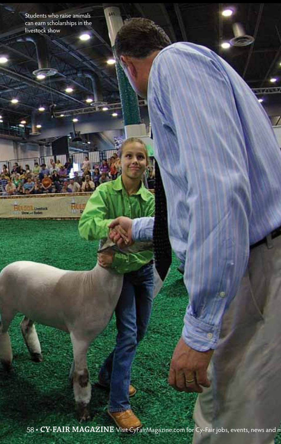
Students who raise animals can earn scholarships in the livestock show

also be discounts at various food and merchandise booths on value days.