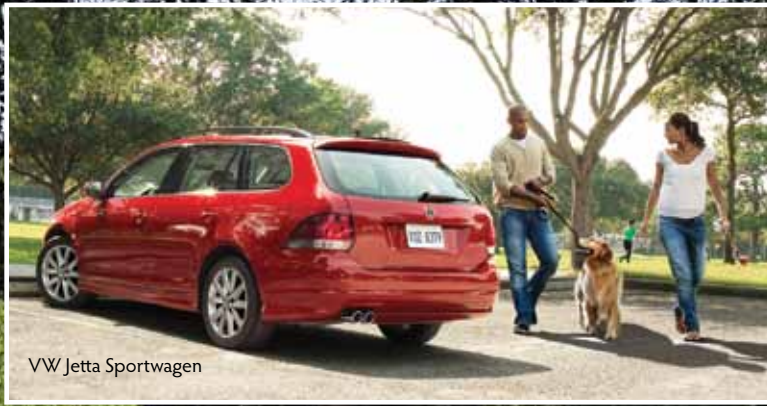
VW Jetta Sportwagen