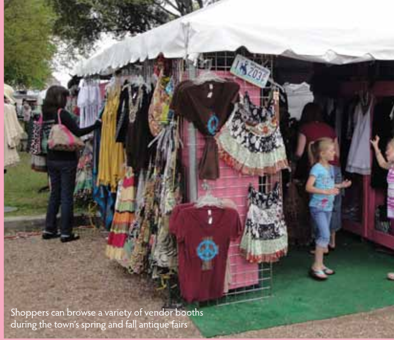
Shoppers can browse a variety of vendor booths during the town's spring and fall antique fairs

These festivals have grown so much, in fact, that they now include towns within a 10-mile radius of Round Top.