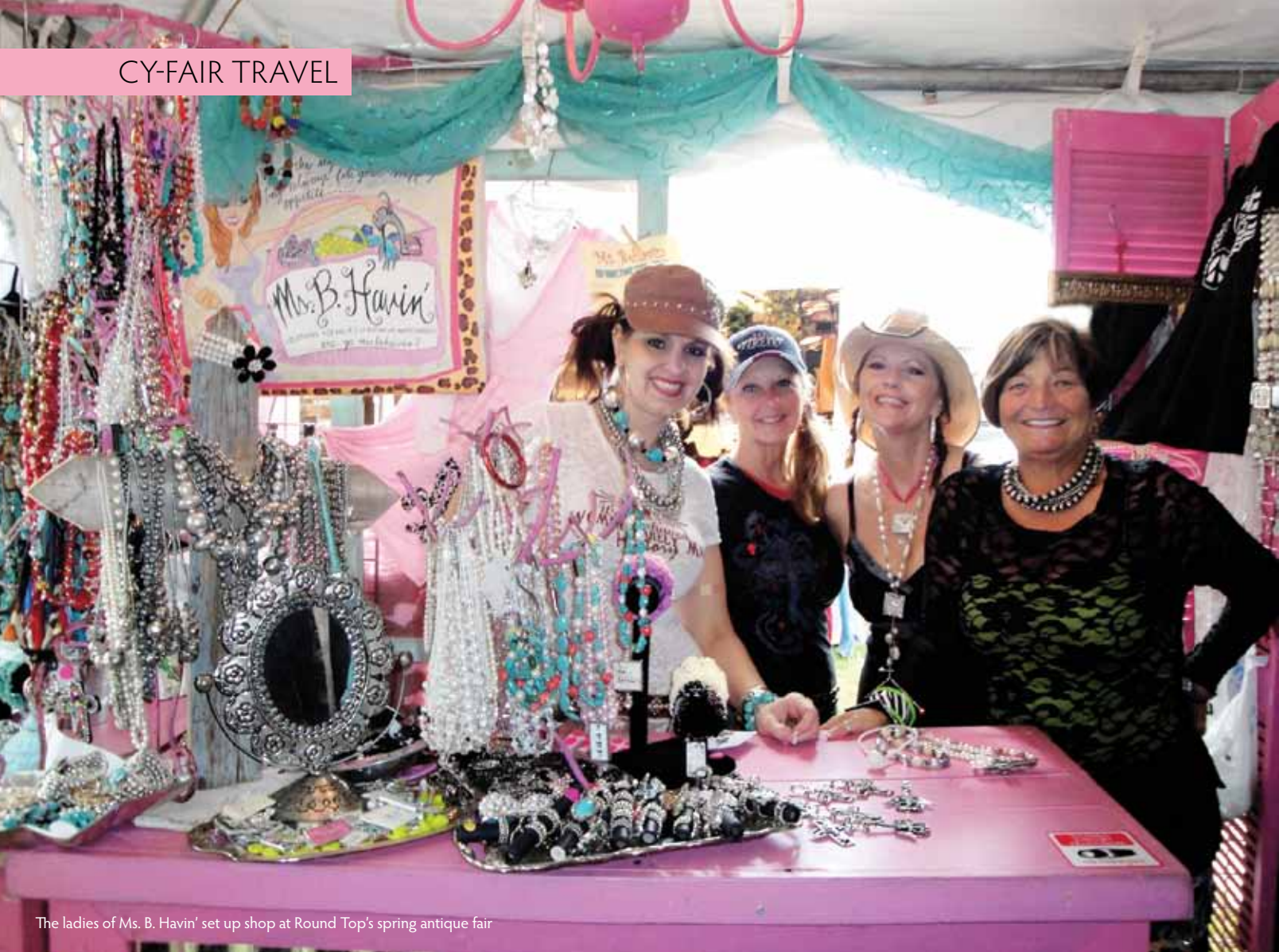
The ladies of Ms. B. Havin' set up shop at Round Top's spring antique fair