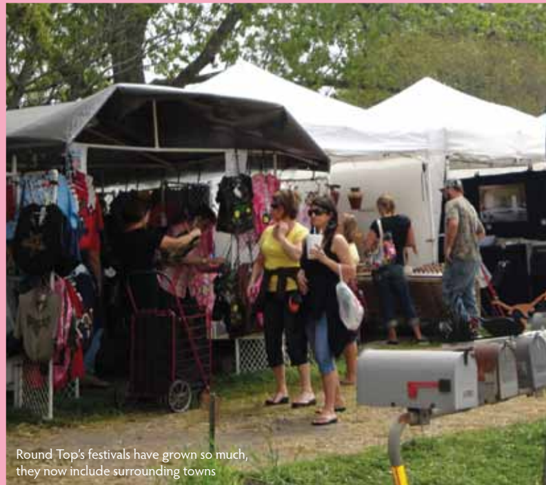
Round Top's festivals have grown so much, they now include surrounding towns