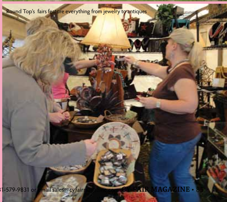
Round Top's fairs feature everything from jewelry to antiques