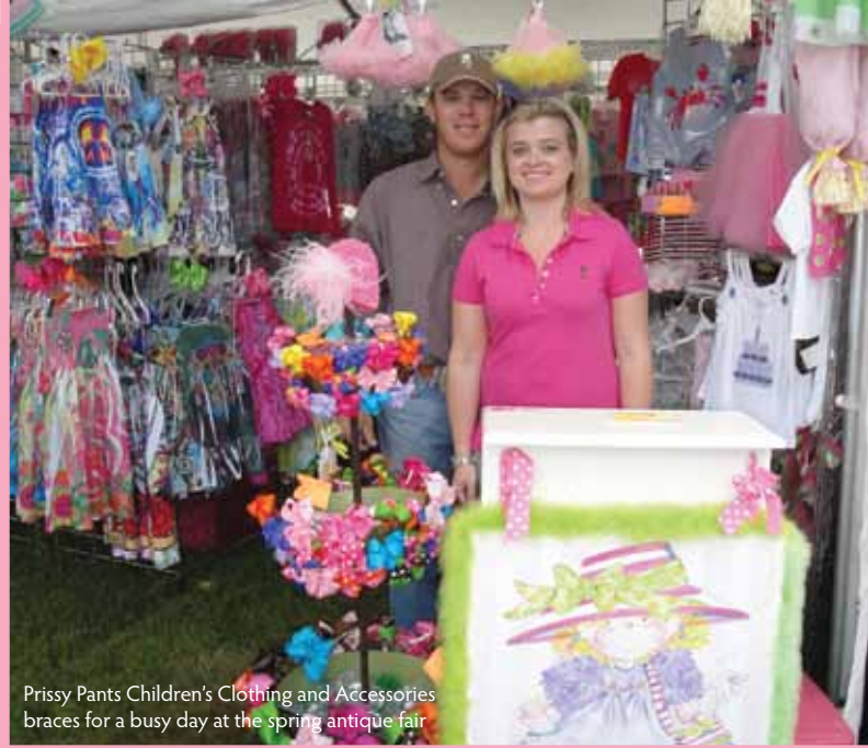
Prissy Pants Children's Clothing and Accessories braces for a busy day at the spring antique fair