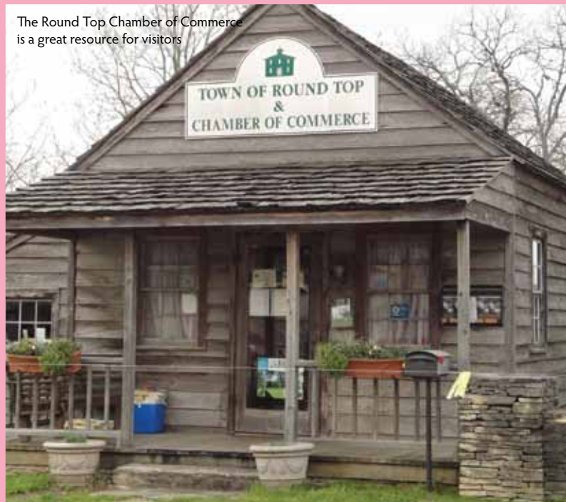
The Round Top Chamber of Commerce is a great resource for visitors