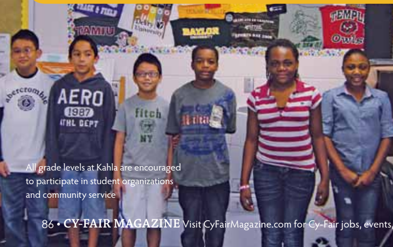
All grade levels at Kahla are encouraged to participate in student organizations and community service