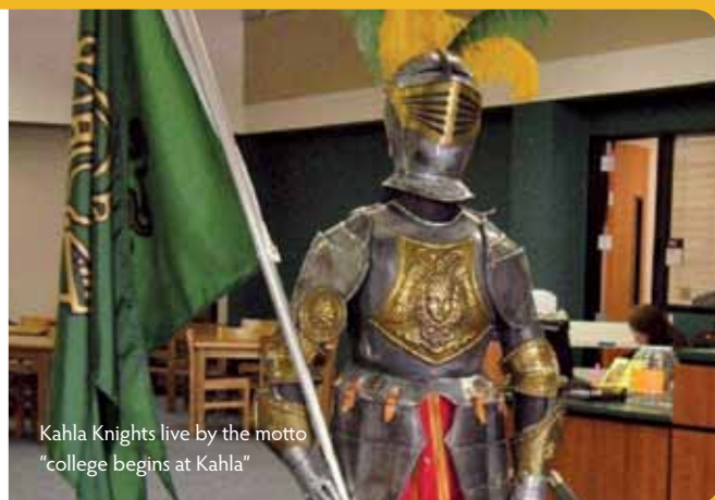
Kahla Knights live by the motto "college begins at Kahla"