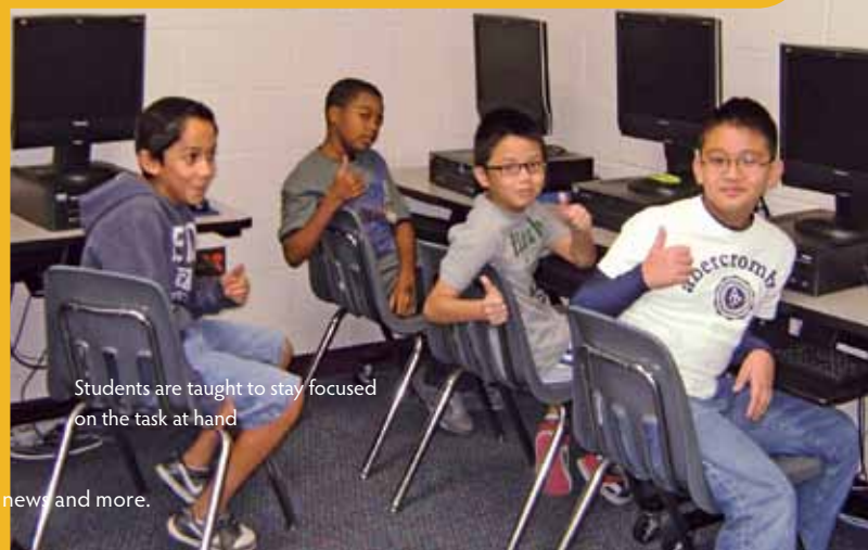
Students are taught to stay focused on the task at hand