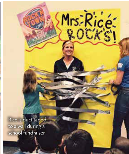
Rice is duct taped to a wall during a school fundraiser